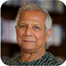
Prof. Muhammad Yunus

Nobel Peace Laureate Founder & Former Managing Director, Grameen Bank